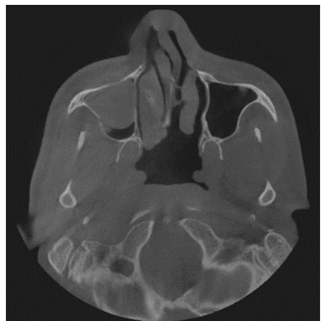
Figure 4. Axial view showing partial opacification

Prevalence of extrinsic diseases in the present study appeared to be 3.4% which included three cystic lesions and one each case of fibro-osseous and benign odontogenic tumor [Figure 5] and one case of congenitally absence of maxillary sinus bilaterally [0.7%]. [Figure 6] Various previous researchers did not report the prevalence of extrinsic lesions in their studies.