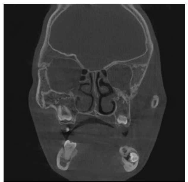
Figure 6. Coronal view showing complete absence of maxillary sinus bilaterally