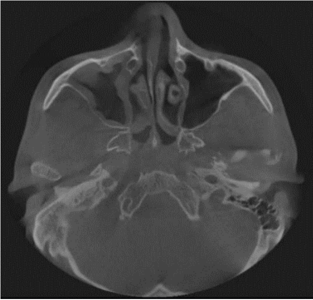
Figure 1. showing mucosal thickening with all the walls on right maxillary sinus