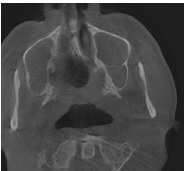
Figure 3. Axial view showing complete opacification bilaterally