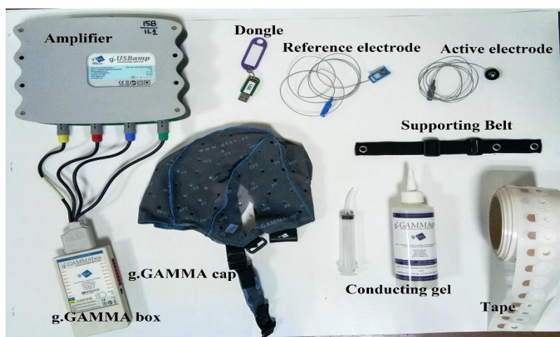
Fig. 1. Experiment accessories used during the EEG signals recording

20 healthy human subjects participated in two recording sessions in which they imagined 20 right-hand movements and 20 left-hand movements per session[20]. The subjects were asked to sit in a comfortable armchair with a distance of 150 cm in front of the computer monitor[21]. Subjects were provided with all necessary instruction for data recordings [22]like the concept of MI and BCI setup, full-body relaxation and no movements during data acquisition[23]–[25][26].Fig. 1 shows the experimental accessories in which g.LADYbird active electrodes (g.GAMMAcap) are placed on the scalp of a subject for EEG data recording.