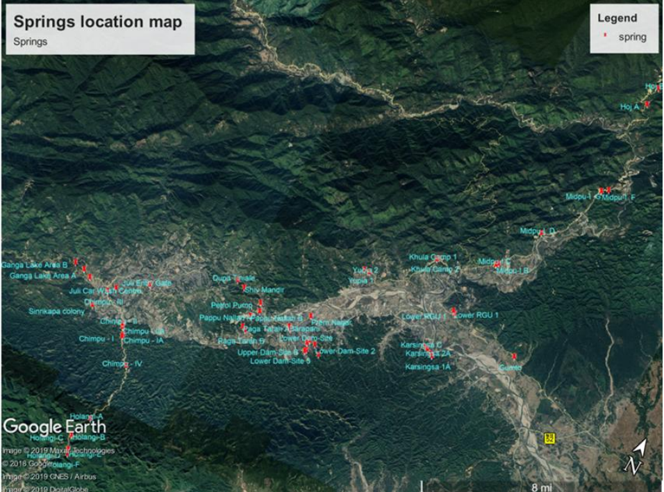
Fig. 1: Spring location map (Papum Pare district, Arunachal Pradesh)